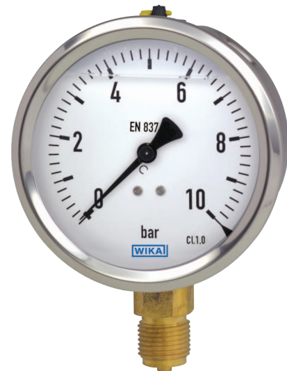
Bourdon tube pressure gauge, model 213.53.100, lower mount